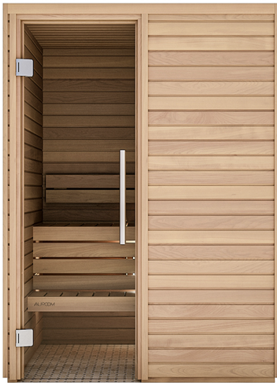
Model 120x150 cm